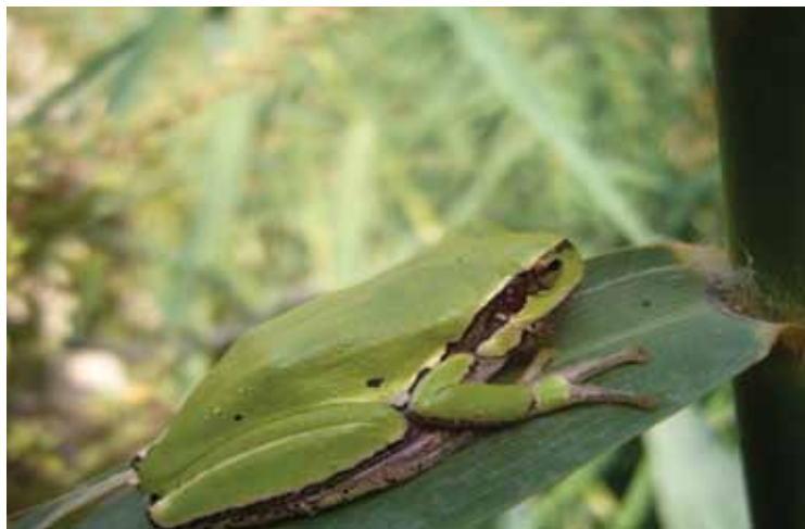
Fig. 6: Hyla cf. savignyi from Idhna.

Beitullo (PMNH1524 ♂ 30.v.2012; PMNH1525 ♂ 30.v.2012). We also observed it in Ein Fara (also reported but under a misnomer by Grach et al. 2007). Also observed at Solomon's pools at Artas .