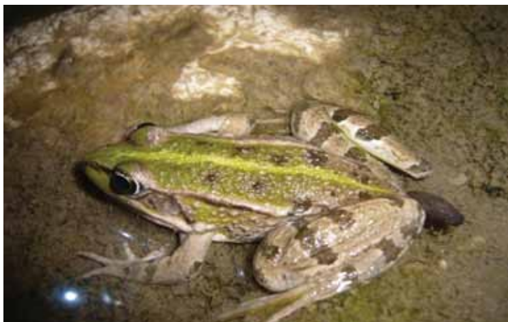
Fig.4: Adult male of Pelophylax bedriagae from Wad Qana.

prompted Schneider et al. (1992) to describe Rana levantina but this is a junior synonym of Rana bedriagae Camerano (1882) (the type from Syria). Morphometric studies confirmed the designation of this species stretching from Turkey to Palestine and Jordan (Sinsch & Schneider 1999). Frost et al. (2006) showed that the valid generic name is Pelophylax and hence the proper name for our frog is P. bedriagae .