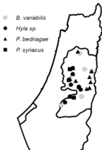
Fig. 1: Light trap sampling location in the period of the study.

25.ix.2010; PMNH1872 ♀ 25.ix.2010; PMNH1873 ♂ 1.x.2010; PMNH1874, ♂ 25.ix.2010); Beit Sahour (PMNH1841 ♀ 2.xiii.2010; PMNH1848 ♂ 4.ix.2010; PMNH1850 ♂ 4.ix.2010; PMNH1851 ♀ 14.ix.2010); Jiftlik (PMNH1979, ♀ , 27.iii.2013; PMNH1980, ♂ 27.iii.2013); Mikhmas (PMNH1700 ♂ 27.iv.2013); Idnah (PMNH1824 ♂ 26.vi.2012). Also we recorded it via observations in Mar Saba, Nebi Saleh, and Jenin .